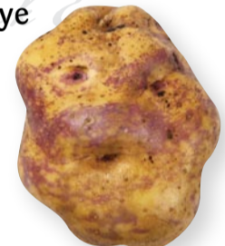
Pink Eye Pink Eye

This variety has a creamy yellow flesh that tends to be waxy with a nutty flavour. Best for salads, boiling, steaming and baking. Grown in Southern Tasmania also known as Southern Gold.