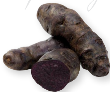
Purple Congo Purple Congo

The Purple Congo is great for mashing, steaming, boiling, microwaving and salads, but not recommended for roasting. It has a very dry texture when cooked.