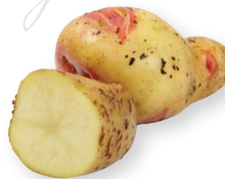
King Edward King Edward

This English variety is great for baking and roasting, good for mash, but not recommended for salads or frying. The King Edward is a floury potato that was one of the most popular varieties of the 20th century.