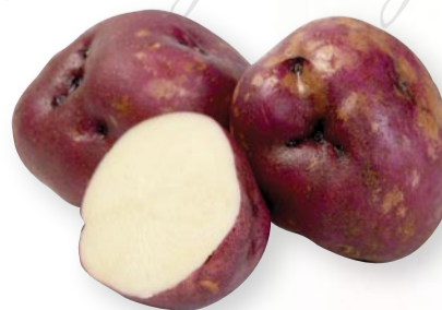
Toolangi Delight Toolangi Delight

The Toolangi Delight is a versatile all-rounder developed in Australia. This variety will mash, bake, fry and is excellent for gnocchi.