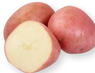
Red Rascal Red Rascal

Red Rascal potatoes have dark red skin, clean white flesh and an oval shape. They are full of flavour and can be boiled, baked, mashed, roasted or fried.