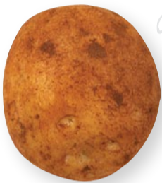
Golden Delight Golden Delight

The Golden Delight is an oval potato that has yellow smooth skin and cream flesh. This potato is a good all-rounder that will give you a great result mashed, roasted or fried.