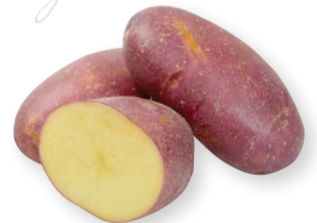
Royal Blue Royal Blue

The Royal Blue variety is long and oval in shape, with purple skin and yellow flesh. It is an extremely versatile potato suitable for all cooking purposes.