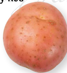
Otway Red Otway Red

Otway Reds are oval potatoes with red smooth skin and cream flesh. These potatoes are good all-rounders that will give you a great result mashed, roasted or fried.